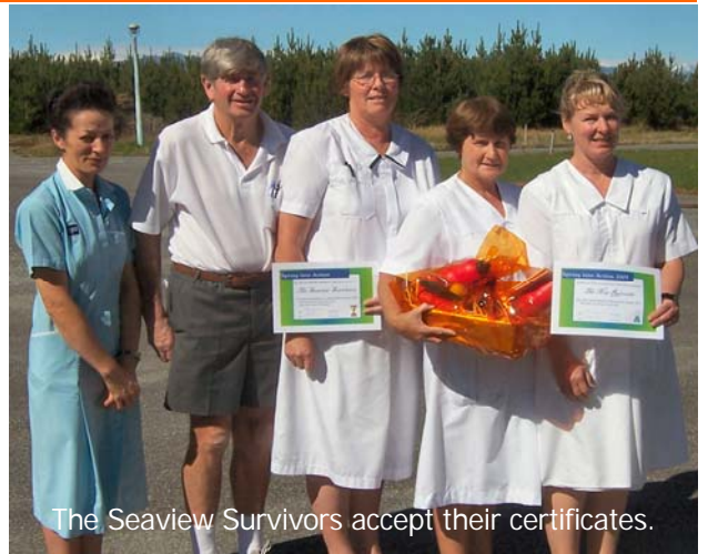
The Seaview Survivors accept their certificates.

"That sort of feedback makes all the effort